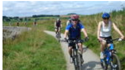
Beginner's mountain bike weekend in Derbyshire