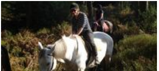
Review of Slieve Aughty Riding Centre, County Galway, Ireland