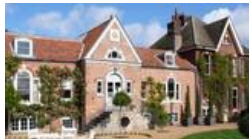
Strattons Hotel, Swaffham, Norfolk, England