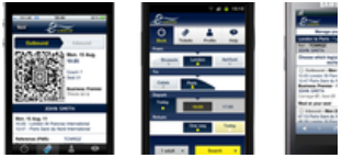
Eurostar launches free app