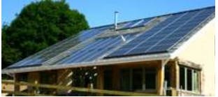
Review of Bosinver Farm Cottages, Cornwall