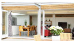
Cranmer Country Cottages, Norfolk, England