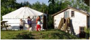
Review of Yarde Bunkhouse, Devon, England