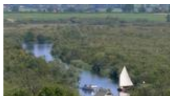
Swimming in the Norfolk Broads, England