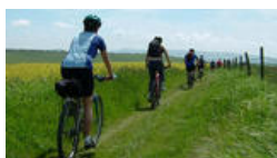
Mountain bike weekend on the South Downs Way, England