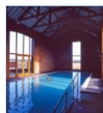
Cranmer's solar-heated, salt-water swimming pool

The new holiday homes at Home Farm are billed as 'zero carbon'. A dubious phrase, but if any place comes close to this then Cranmer does. The owners have gone to great effort to maximise alternative energy sources - there's under floor heating throughout the cottages, and hot water and space heating are supplemented by solar, wind power (there's a huge wind turbine on the farm's grounds), and a ground heat source pump. The buildings are highly insulated, rain water is harvested and all on-site water comes from the owner's own borehole. The swimming pool ( right ) is heated by solar collectors and is cleaned using salt-water chlorination. The entire operation has been awarded Gold by the Green Tourism Business Scheme . Carbon Neutrality is a much over-used (and abused) term, but Cranmer's three new cottages are an excellent example of how a luxurious accommodation can attempt to be carbon neutral. To have achieved this and offer a five-star service is exceptional. I can't think of another five-star self-catering accommodation in the UK that is as green as Cranmer. Come here to see how it's done!