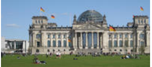
Greentraveller's Guide to Berlin, Germany