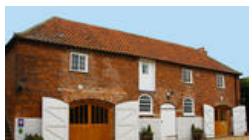
Manor House Stables, Lincolnshire, England