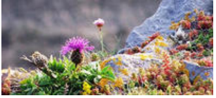
10 Reasons to Visit Carmarthenshire