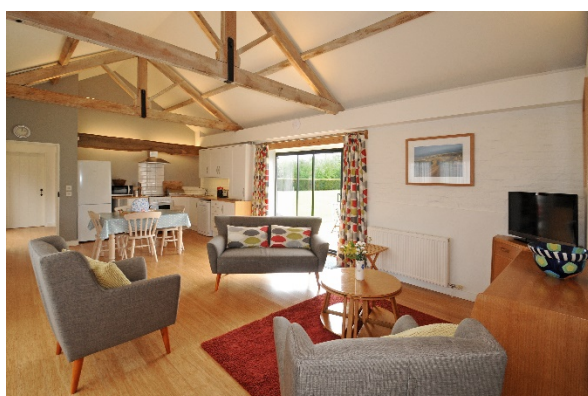
Tern living space