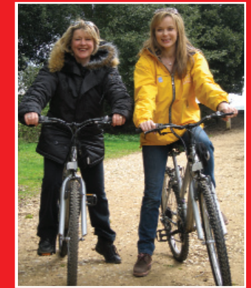
Amanda Holden and friend enjoying a day's cycle hire from 'On Yer Bike'

Enjoy a trip to the seaside or follow one of the many single track roads through the beautiful Norfolk countryside.