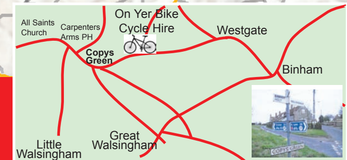
On Yer Bike is located just outside Wightsom on the Binham Road 3/4 mile from Copys Green

Cycling is a fun and healthy way of seeing North Norfolk so get 'On Yer Bike' today.